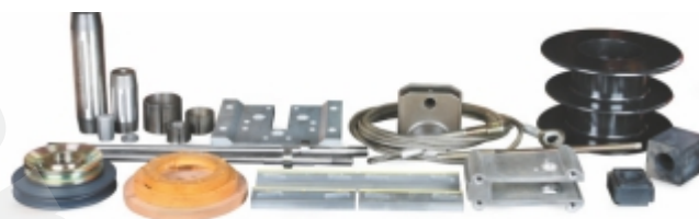
Jumbo Drill dijelovi