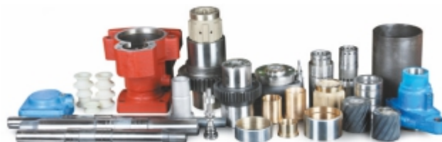
Furukawa Hidraulični dijelovi(HD609-II)