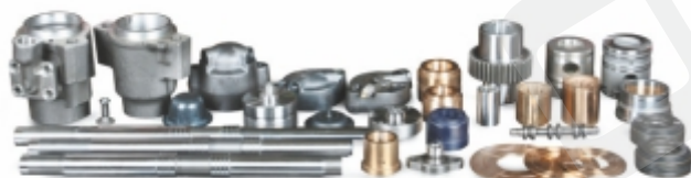
Atlas Copco rezervni dijelovi