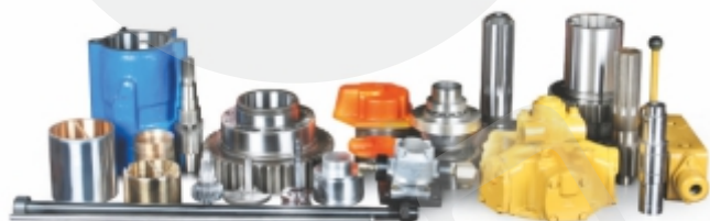
Furukawa Pneumatski dijelovi (PD200)